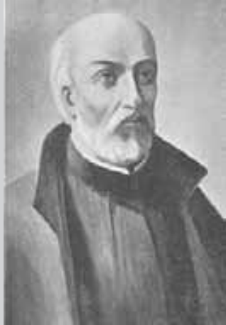
St. John de Brebeuf