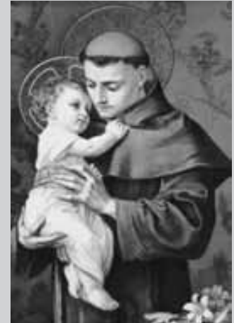
St. Anthony of Padua